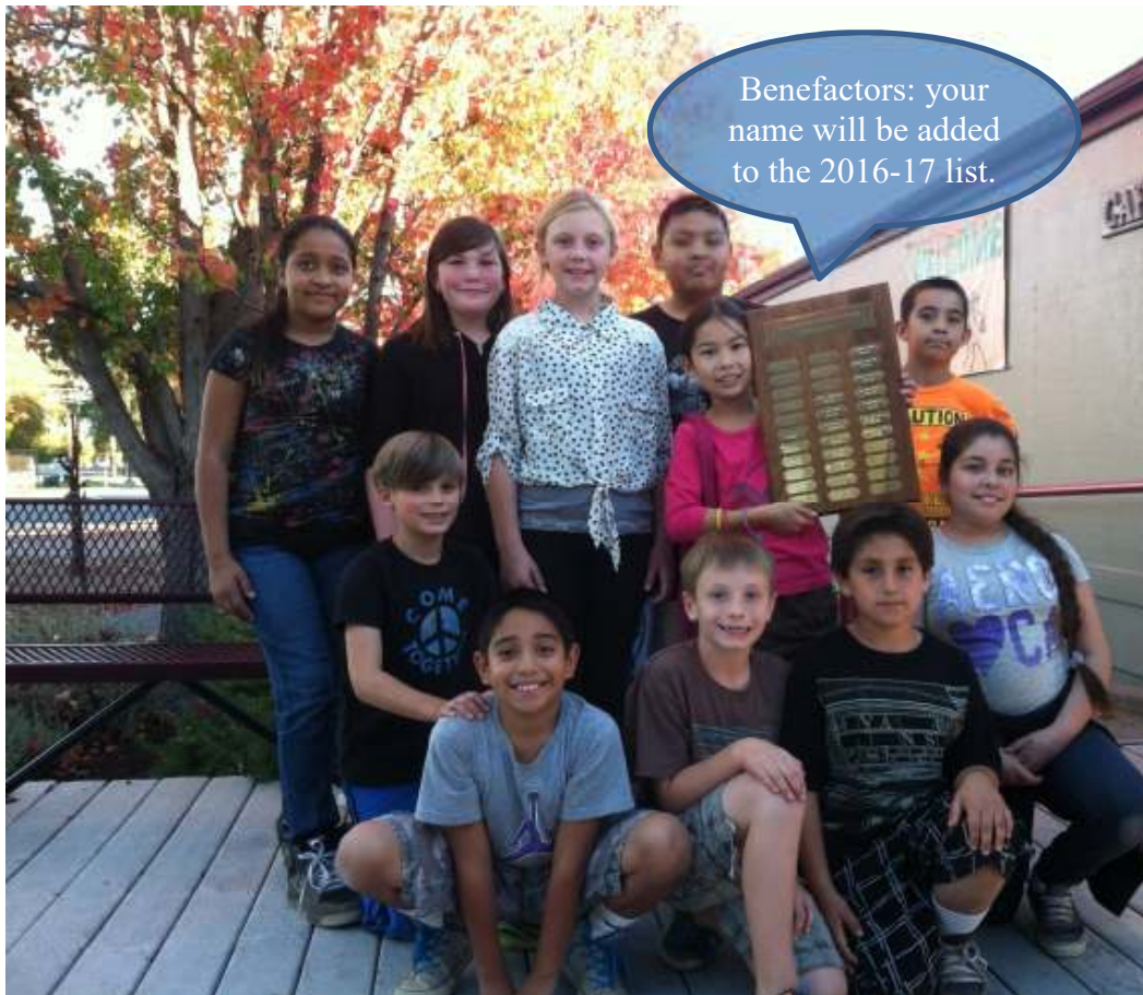
Our kids rally around the Partners in Business plaque to say, "Thank you Benefactors!"