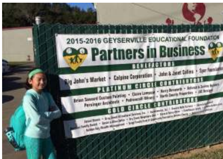
2015-16 banner on display in front of Geyserville Elementary School. We'd love to show our appreciation to you on the 2016-17 banner!