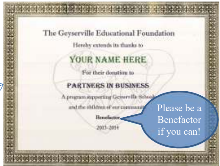
Platinum Circle Partners and Benefactors will receive a certificate like this for 2016-2017.

* Please reply with your donation by January 31, 2017 , to ensure your name is included on the new banner when it is unveiled at the Geyserville Educational Foundation's event in February.